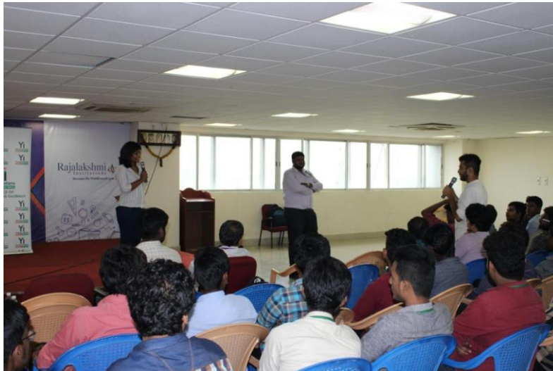
Guest Interaction with Participants